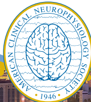
Exhibit & Support Opportunities

FEBRUARY 6-10, 2019 ✦ CAESAR'S PALACE ✦ LAS VEGAS, NEVADA